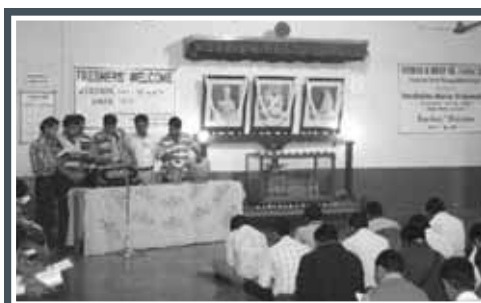
Vocational Training imparted at Don Bosco Self Employment Research Institute under B&R Vishwakarma Scheme of Self Development