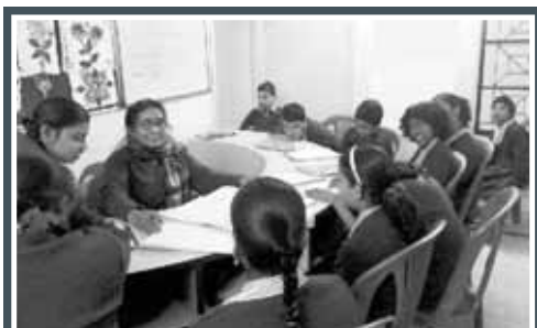
CSR initiative undertaken for Institute for the Handicapped and Backward People

Company is enduring its CSR activities as per DPE Guidelines through its B&R Vishwakarma Scheme of Skill Development by the implementing partner agencies viz Ramkrishna Mission Shilpamandira Community Training Centre(RKMSCTC) , Don Bosco Self Employment Research Institute (DBSERI) & Institute for the Handicapped and Backward People for growth of unemployed, Handicapped uneducated and distressed youths of the Community. This financial year 280 youth has been catered through Company's B&R Vishwakarma Scheme of Skill Development. The youths have been given short term skill development training on trade like Machinist, Electrical, Fabrication, welding, AC & Refrigerator Rep, Automobile Mechanic, Computer application. Company is looking forward to expand its CSR activities in backward district in coming days.