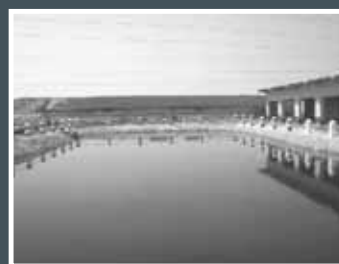
Rainwater Harvesting project near B&R's project site at BHEL / Andal