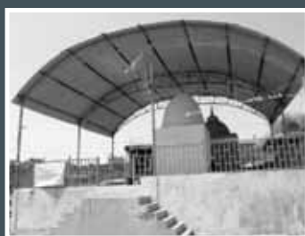
Construction of Community Shed near B&R's NTPC Dhule project site