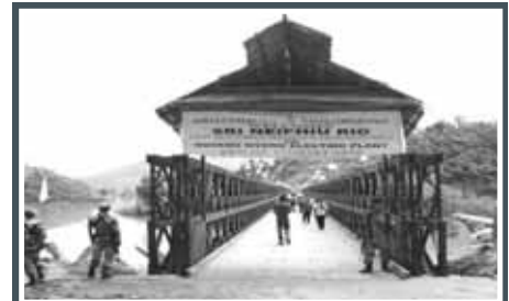
Asia's 2nd Longest Bailey Bridge Fabricated & Erected by B&R for NEEPCO, Nagaland