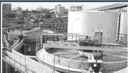
Treatment Plant, Raw and CW Make-up Water System Package for NTPC Rihand Super Thermal Power Project

The amount utilized for capital expenditure is fully financed through internal resources of the Company. No government assistance had been sought for.