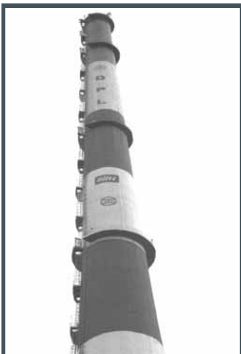
220 M high RCC Chimney for 1 X 250 MW Unit at Durgapur Projects Ltd.

Despite fierce competition among Public and Private sector enterprises, B&R has been able to book orders of value ₹ 2491.69 Crores for the FY 2013-14 from various clients including Public and Private Sectors. This is the highest ever Order Booking achieved by the Company till date. However for the last year (i.e. 2012-13) the value was ₹ 1601.58 Crores.