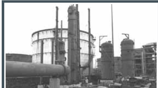
Mechanical Works for Offsites for M/s. Mangalore Refinery & Petrochemicals Ltd