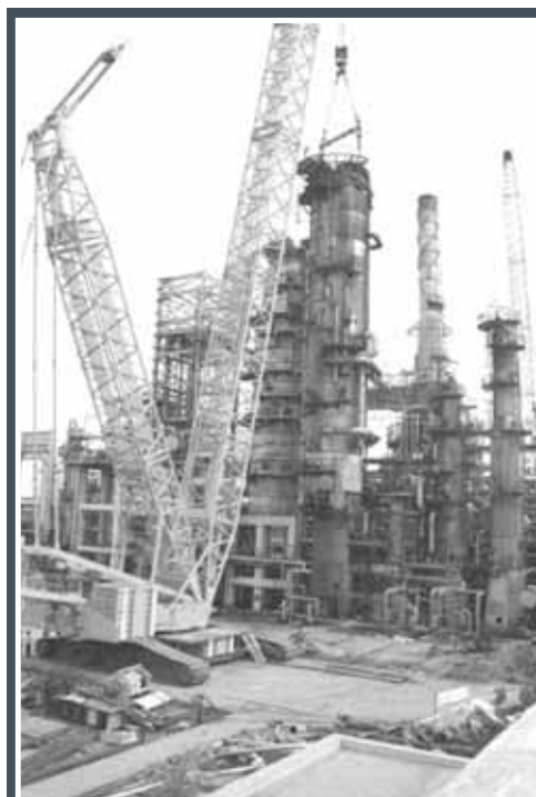
CDU / VDU - II Revamp Project in Chennai Petroleum Corp. Ltd.