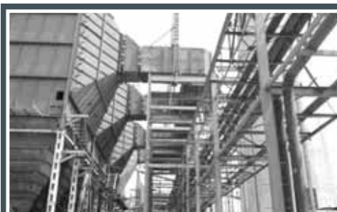
ESP for NTPC's Rihand Super Thermal Power Project