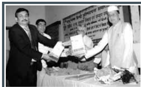
B&R received "Rajbhasha Ratna Award - 2014" from Rashtrabhasha Swabhimani Nyas, Ghaziabad for excellent work in implementation of Hindi Language

In order to ensure compliance of various statutory requirements regarding the "Progressive Use of Hindi" and to enhance awareness of employees regarding its use in the day-to-day workings of the Company, B&R's Official Language Implementation Committee (OLIC) is constantly pursuing its efforts to review and monitor the progress achieved in this regard, four OLIC Meetings were held during the year. To impart knowledge of Hindi to the non-hindi knowing employees, regular Hindi Classes are conducted in both the Offices located at Howrah & Kolkata. Total number of employees who had passed the Hindi "Prabodh" "Praveen" and "Pragya" Examinations upto November, 2013 stands revised at 362, 319, and 292 respectively. "Cash Awards" and "Personal Pay" are granted to employees for passing the Hindi Examinations as per Govt. Directives. 'Rajbhasha Pakhwada' was observed from 14th to 28th September, 2013 and various Hindi Programmes/Competitions etc. were conducted during the "Pakhwada". To create interest amongst employees, one Hindi Word/Phrase with its English equivalent is written on White Boards and displayed at prominent places in the Office Premises. The Company is a "Working Committee Member" of the Town Official Language Implementation Committee (PSUs)-Calcutta (CALTOLIC), under the Ministry of Home Affairs (Govt. of India) and takes active part in all its Programmes/Activities.