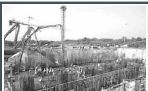
BOTI Package for 2 X 700 MW Kakrapar Atomic Power Project of Nuclear Power Corpn. of India Ltd. for Dodsai Enterprises Pvt. Ltd.