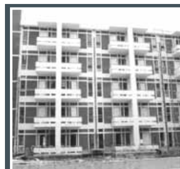
Construction of 2000 capacity Boys Hostel at IIT Kharagpur

On behalf of the Board of Directors, it is our pleasure in presenting to you the Annual Report on the working of the Company, together with the Audited Accounts for the year ended 31st March 2014. The year 2013-14 was a year of slower economic growth resulting in cut throat competition in the Engineering, Procurement and Construction (EPC) Sector. However, the Company performed reasonably well in spite of such slowdown. As a matter of strategy, we are ramping up our operation to increase order booking and execution capability to increase visibility to our projects.